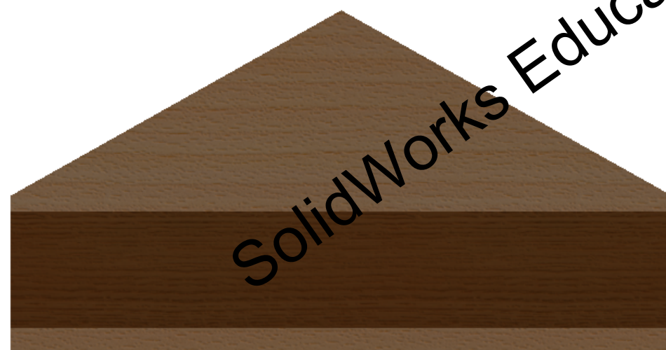
ELEVATION OF FINAL PIECE